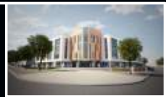
INTERNATIONAL COLLEGE CAMPUS