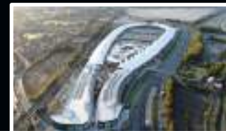
MCARTHURGLEN DESIGNER OUTLET CENTRE