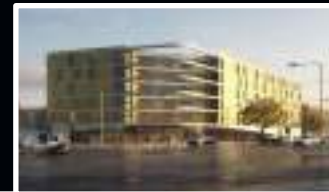
HAMPTON BY HILTON