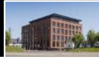
ASHFORD COMMERCIAL QUARTER